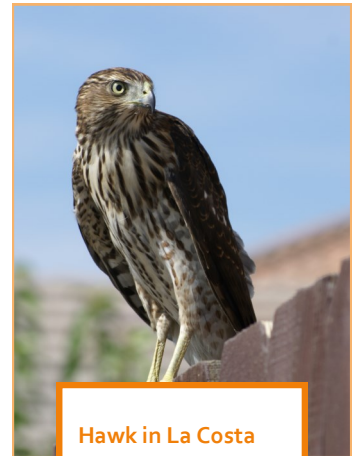
Hawk in La Costa